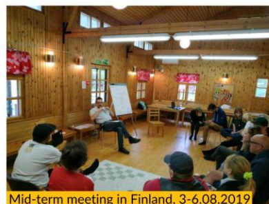
Mid-term meeting in Finland, 3-6.08.2019