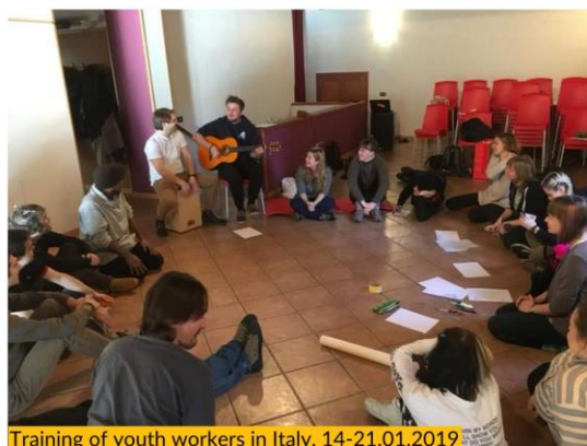
Training of youth workers in Italy, 14-21.01.2019

The booklet and the printed version will be available for free to anybody and we will follow the results of the research in coming projects that we have already started to work on.