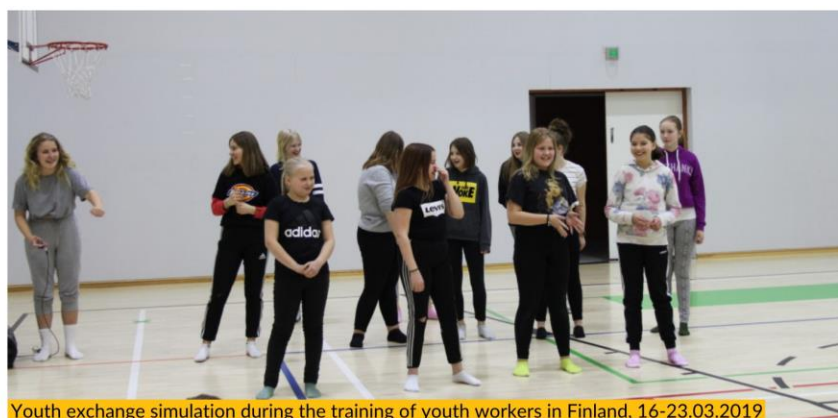
Youth exchange simulation during the training of youth workers in Finland, 16-23.03.2019

All participants in the trainings of this project, who express their interest, will be allowed to work in our partner organizations and are invited as recognized members to the “Drums for Peace” artists community. Also, all the partners of this project will try to make an impact in youth work and youth policy locally, nationwide and in international context.